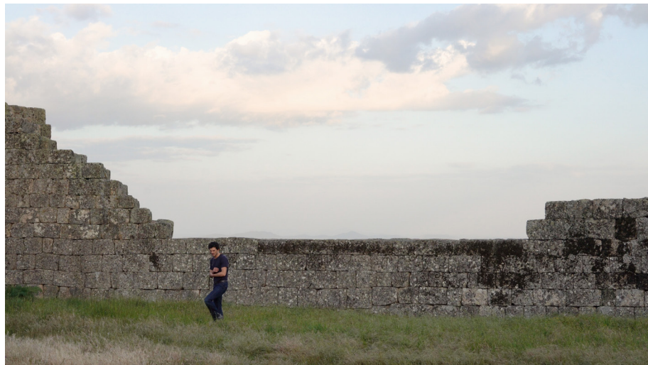
from Views on Views (video), 2019